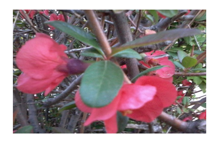
- 8 -